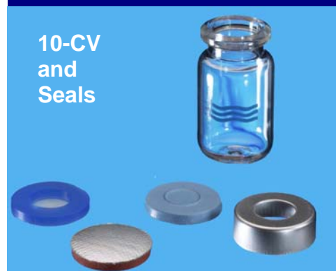
10-CV and Seals